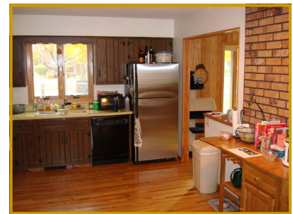
Below: The "before" photo.