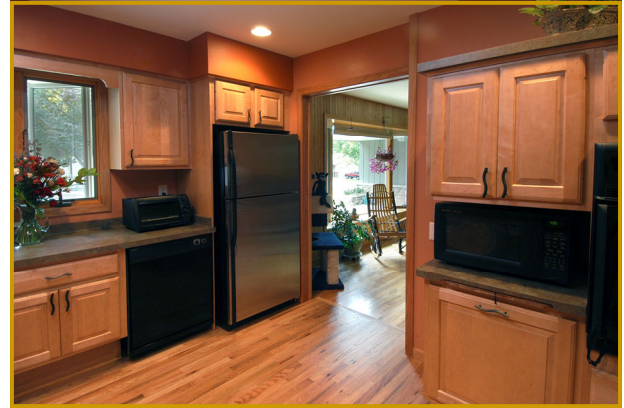
Above: The finished project!

to access refrigerator, oven, stoves, hood fan and dishwasher with new found ease. With the custom installed pull out storage shelves, she can easily access pans and cookware, spice and dry goods to prepare her meals. She can move seamlessly through the kitchen and from room to room with wider doorways and smooth floor transitions. The project was finished on time and ready for her to entertain family and friends at the first Easter dinner she was able to cook herself! It was a very festive dinner in that many prayers had been answered!