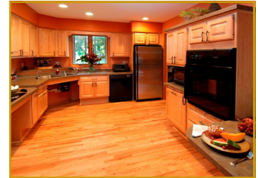
This gorgeous kitchen became an accessible haven for the homeowner.

It was also very important to design a warm, modern feel to the room that would not "look" accessible at first glance. We wanted to create a universal