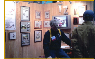
Come visit us at the TZ of Madison booth #522A at the NARI Remodeling Expo.

On your way through the show, we would sure enjoy it if you were to stop by and say "Hi!" TZ of Madison, Inc. will be at booth #522A!